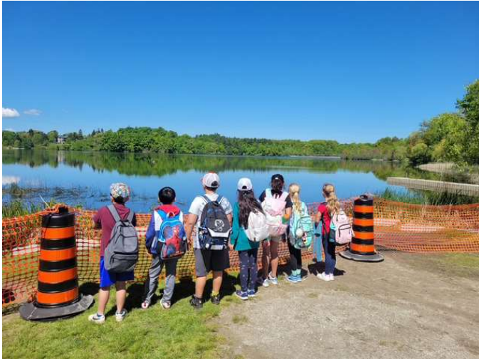
Peel Safety Village, May 26 th

Be sure to follow us on Twitter: @DpcdsvStvdp